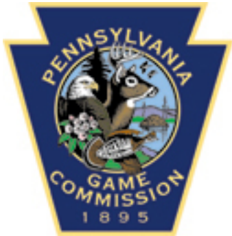
Pennsylvania Game Commission

Pa Litter Bug Captured In The Act By Photo Bug