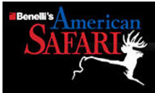
Benelli's American Safari