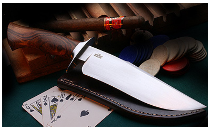
Wilson Tactical Custom Alliance Knives