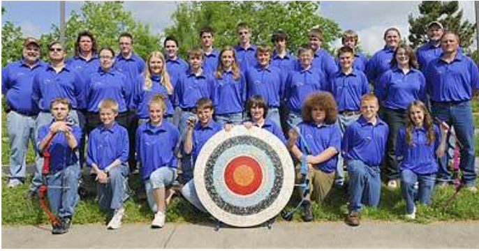
NASP Archery team wearing the EOTAC Shooting Sports Polo Shirt