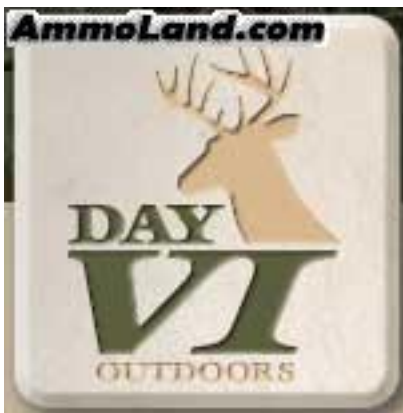
Day VI Outdoors

Columbus, GA – (AmmoLand.com)- Even in states that allow year-round feeding, many hunters decide to discontinue feeding deer in the fall. Many believe that the mast crop will be enough, or that their annual food plots will provide sufficient sustenance for the deer, but these assumptions fail to take several factors into consideration.