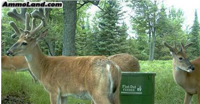
Fall Deer Feeding