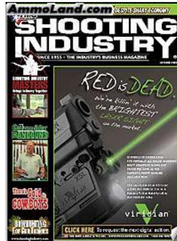
Shooting Industry Magazine

Browsing is easy. You can click on page corners to browse the issue. You may also click on the forward and back arrows above to navigate through the pages.